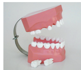
#14 and #16 teeth are removable.